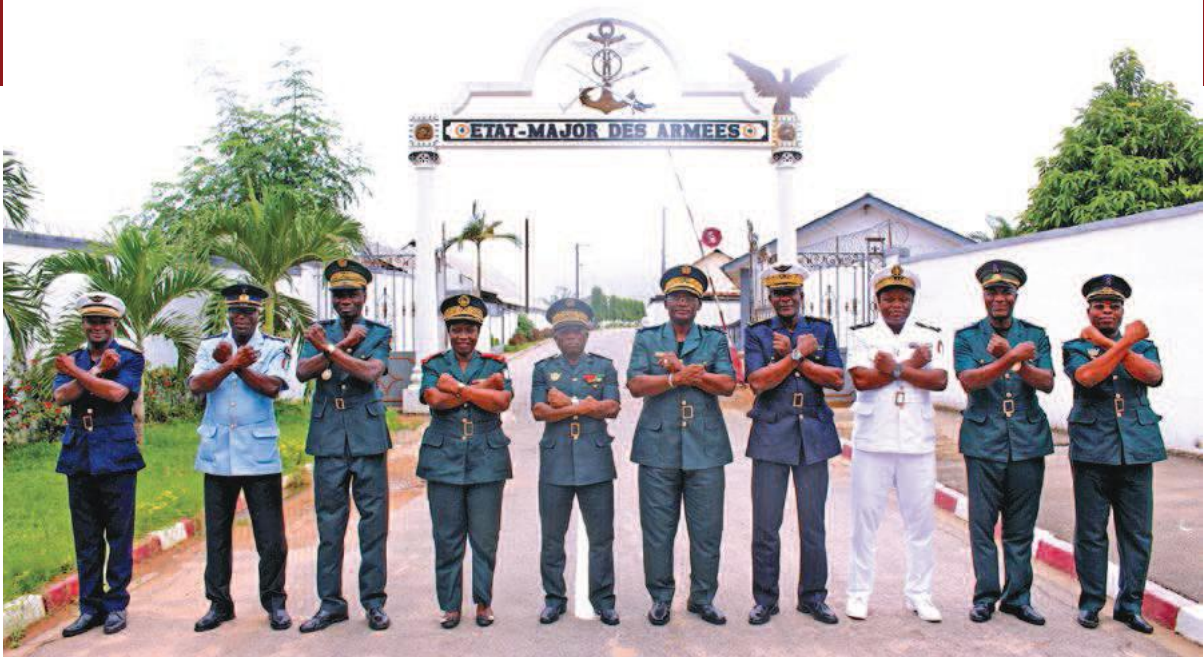
UNFPA Côte d'Ivoire Country Office

GBVIMS Steering Committee activities and GBVIMS rollout sites.