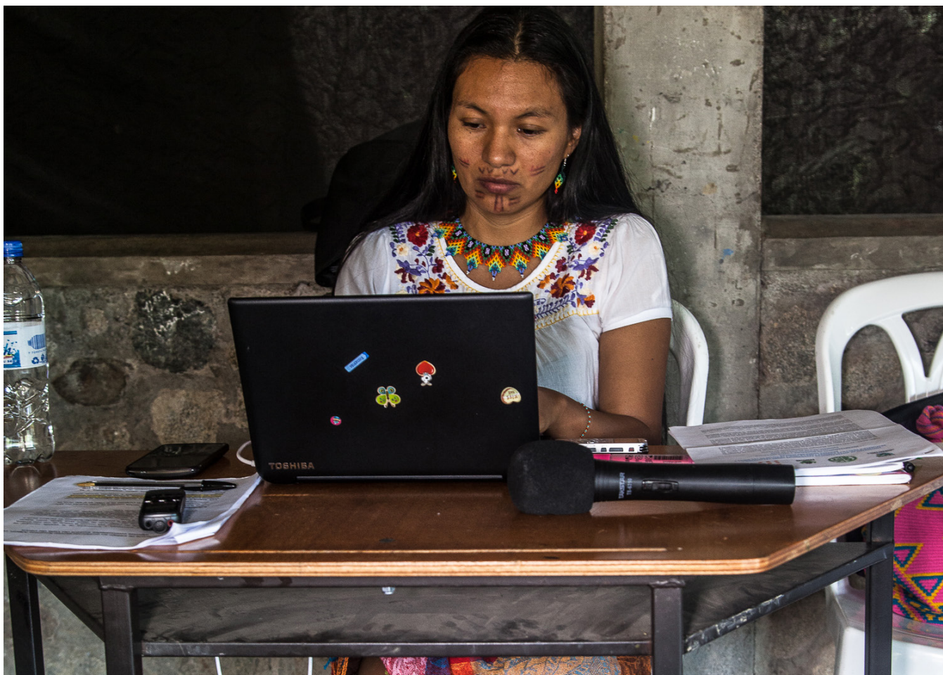
UNFPA Latin America and the Caribbean

Despite progress, accountability to survivors of TF GBV through law and policy remains a challenging area to address. Existing legal frameworks are often insufficient and lag behind rapidly evolving technology and emerging forms of violence. Even though there is growing recognition of TF GBV as a form of discrimination that violates a range of human rights and freedoms, including the rights to access information and participation; to a life free from violence; to freedom of expression; to privacy; and to participate in public and political life, available evidence highlights an important structural gap in accountability mechanisms. There is a high rate of failure by law enforcement to implement appropriate corrective measures to tackle TF GBV (UNFPA, 2021a; The Economist Intelligence Unit, 2021).